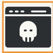
DARKNET AND BLOCKCHAIN