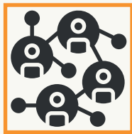
OSINT AND SOCIAL MEDIA