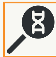
ON-SCENE CRIME FORENSICS