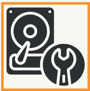
DAMAGE MEDIA RECOVERY